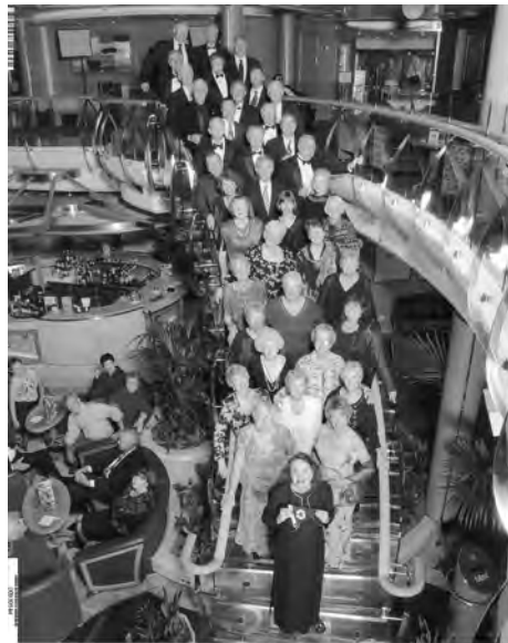
TARETTE'S CRUISE 2006

the day of the memorial service so that they will be free of the duties