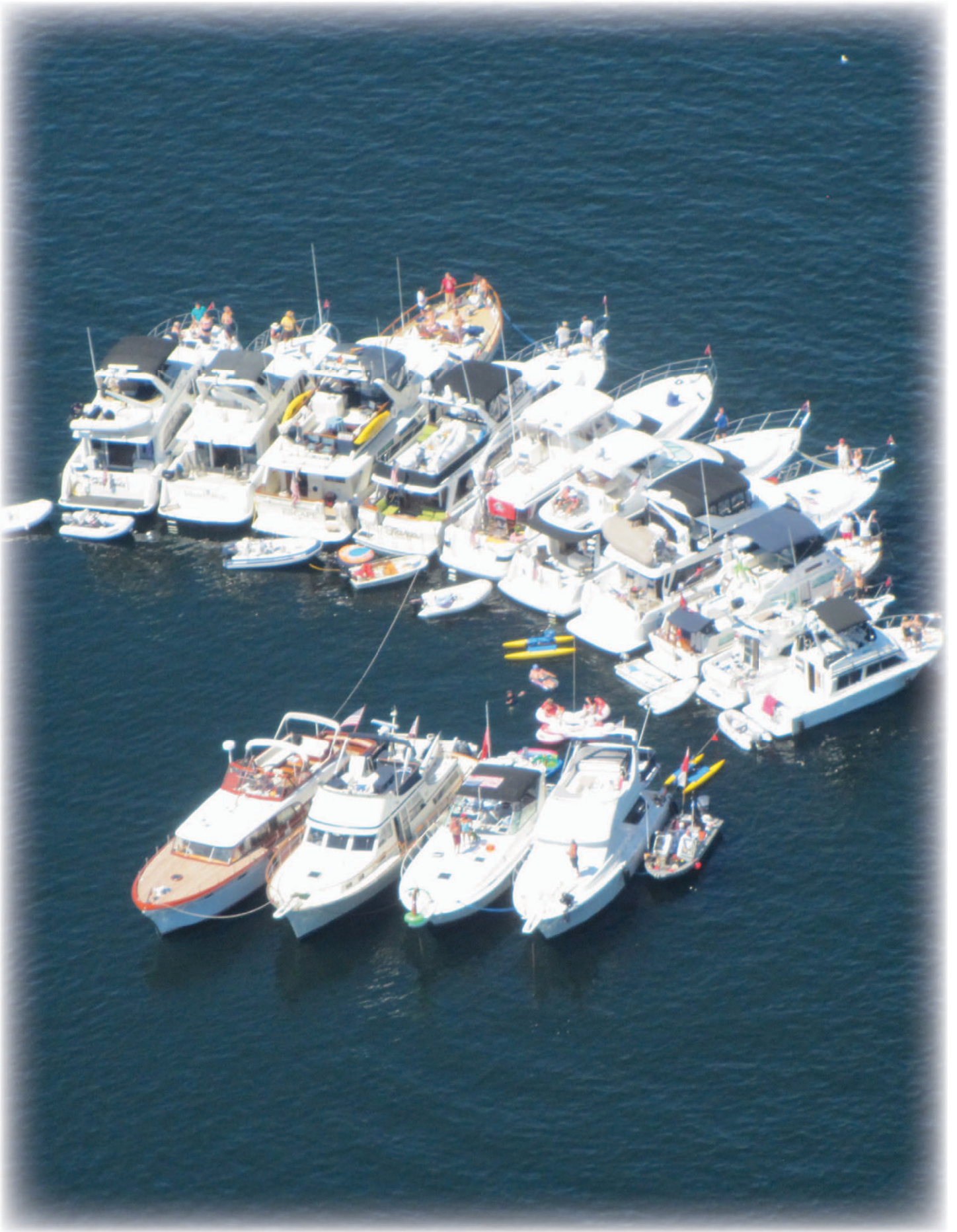
Andrews Bay Raft Up and Aerial Photo