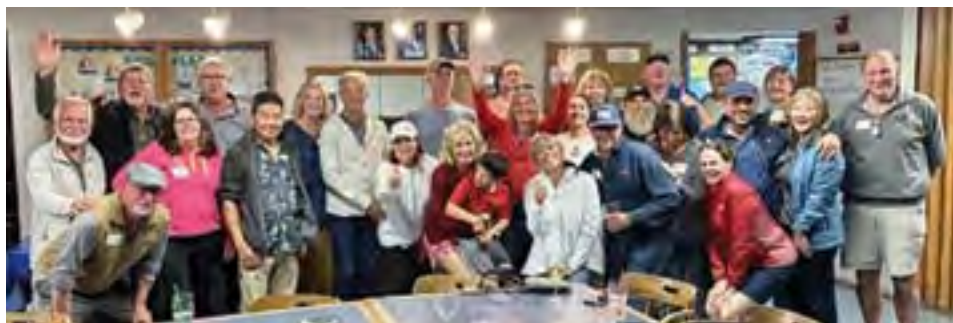
Fleet Captain's Cruise Crew at the Oak Harbor Yacht Club. More photos on Page 4

Fleet captains had a great time leading the summer cruise this year! With 20 boats and over 40 members, we visited five ports as a group and had an "open door" policy for other QCYC members to join us who happened to be cruising in the area. There are too many highlights to list, but a few come to mind such as crabbing and watching the old salts teach newbies the art of catching nothing. The chainsaw tailgater, multiple evenings of karaoke, with a special duet with "Chad" and our soon to be first lady. Potlucks with a delicious variety of foods, group dinners filled with stories and laughter, and of course evening dinghy cruises! All 10 days reinforced club friendships on and off the water. Thank you to all the members that made the cruise so enjoyable!