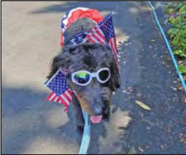
Patriotic Pooch Parade produced proud pups