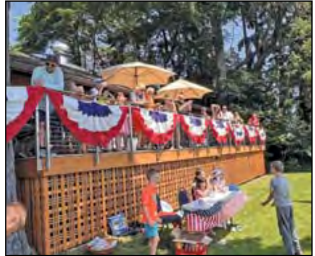
QCYC Kids judge Patriotic Pooches July 4th weekend