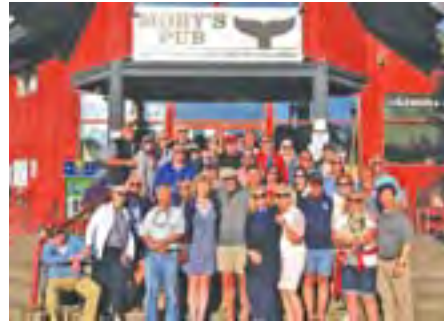
Fleet Captains' Cruisers at Salt Springs Marina, B.C. Deck