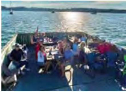
Fleet Cruisers Brew Crew on Deck