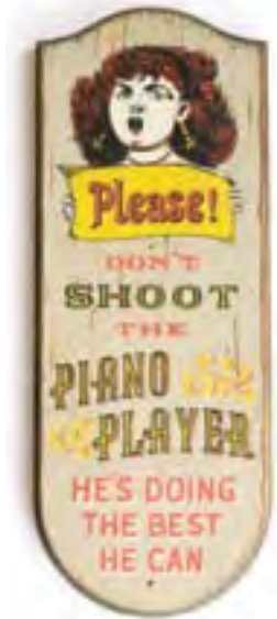
Piano player for Desolation Sounds wanted

A: We are available to play selective private events for a nominal charge. (Often less than it would cost to hire a DJ). We have played Commodore's Balls for some non-Grand Fourteen clubs who rent QCYC's third deck for their events. Some of the private events have included parties and celebrations hosted by members but not officially a club event. Nobody on the Music Committee takes any personal money from private events. We use the money strictly to offset performance-related expenses and maintain/ upgrade our sound system.