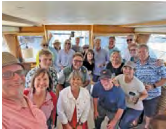
Fleet Cruisers Landing at Roche Harbor Resort