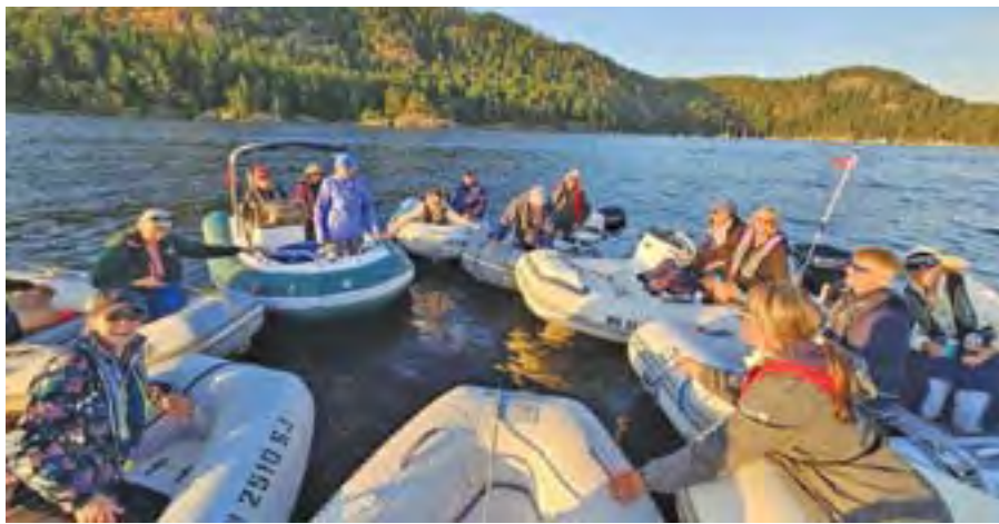
Cruisers form Dinghy Wagon Wheel en route from Pender Canal to Poet's Cove