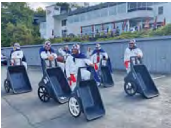
During Closing Day Weekend, Look for the Return of the well-oiled QCYC 'Dock Cart Drill Team'

There will be three dock challenges: 1) Best Skit – Entertainment Night 2) Best decorated Float or Car – Closing Day Parade 3) Participation – spirit, noise, costumes etc. (numbers)