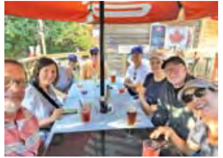
QCYC Fleet Cruisers at Montague Harbour Marine Park Deck