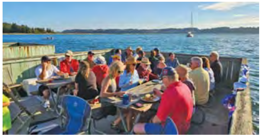
Fleet Cruisers enjoy waterfront lunch