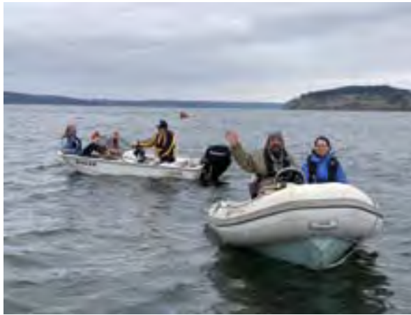
Fleet Cruisers Crabbing in Oak Bay - Oak Harbor