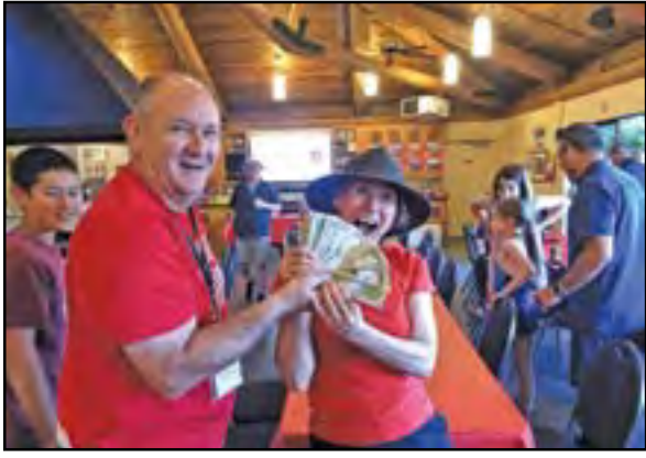
Left-Center-Right Game Winners