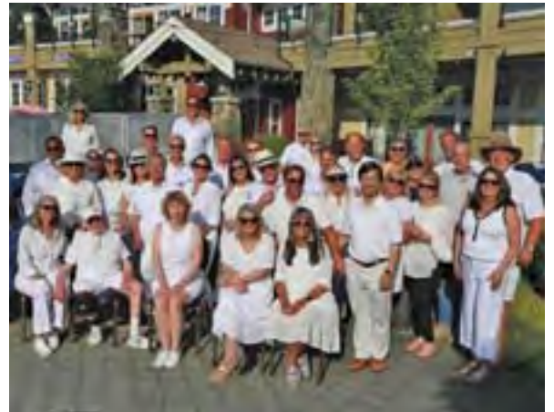
Fleet Cruisers' 'White Party' at Poet's Cove