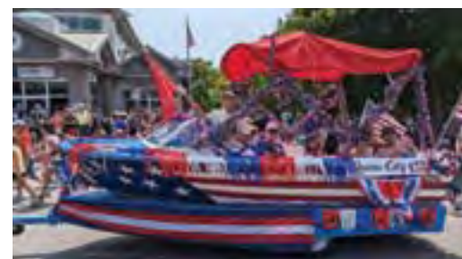
July 4th Kids Parade Float Boat is a 27 year QCYC tradition. More photos on Page 5