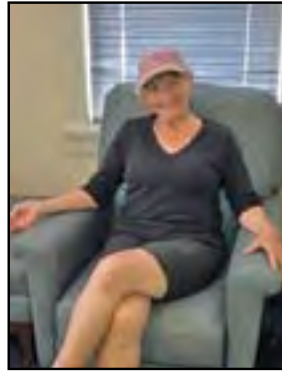
Tarettes funds a chair and ottoman for the 3rd Deck Ladies Room

I look forward to seeing you throughout the year. Remember, Safe Boating is no Accident.