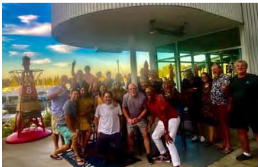
Mainstation Summer Crew knows how to party too!