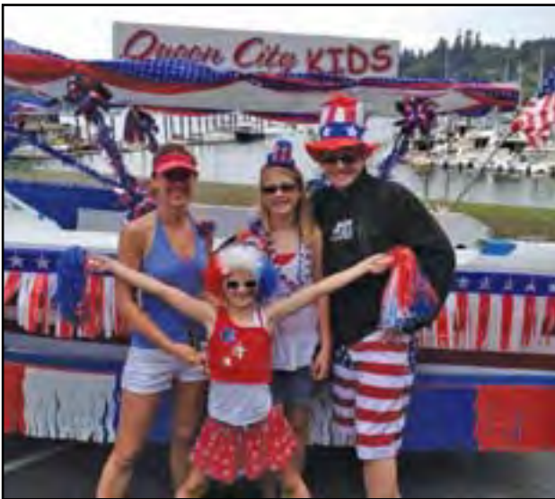
Preparing the QCYC Kids Float Boat for the Parade