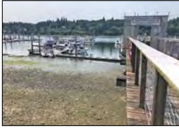
Low Tide at the Outstation during July 4th festivities