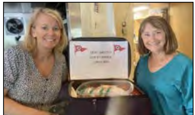
Tarettes provided sandwiches, chips & Twinkies for QCYC Parade participants