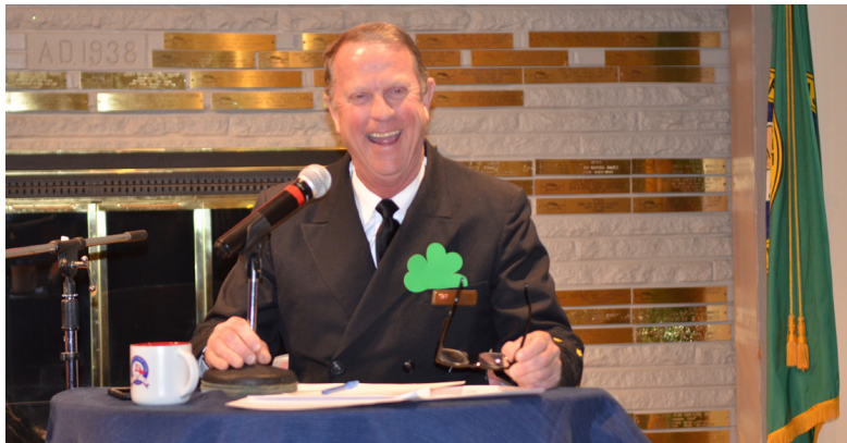
The Tonight Show starring Scotty Grimm.