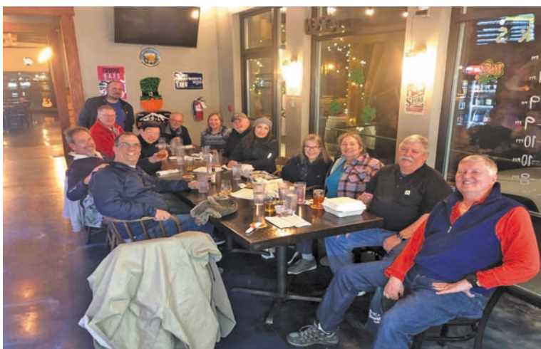
Fleet Captains' Cruise crew at Port Orchard Cruise-in