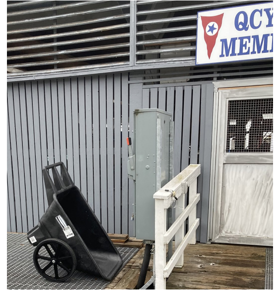
Secure dock carts inside security gate

Feel free to remind a fellow member who "forgets" to put their cart away, or ultimately do (as I did) if the forgetful member isn't on scene-, open the door and put the cart out of harm's way.