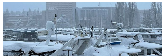
Heavy snow is a no go for canvas tops

It's pretty dangerous up there, and we could easily damage the waterproof membrane.