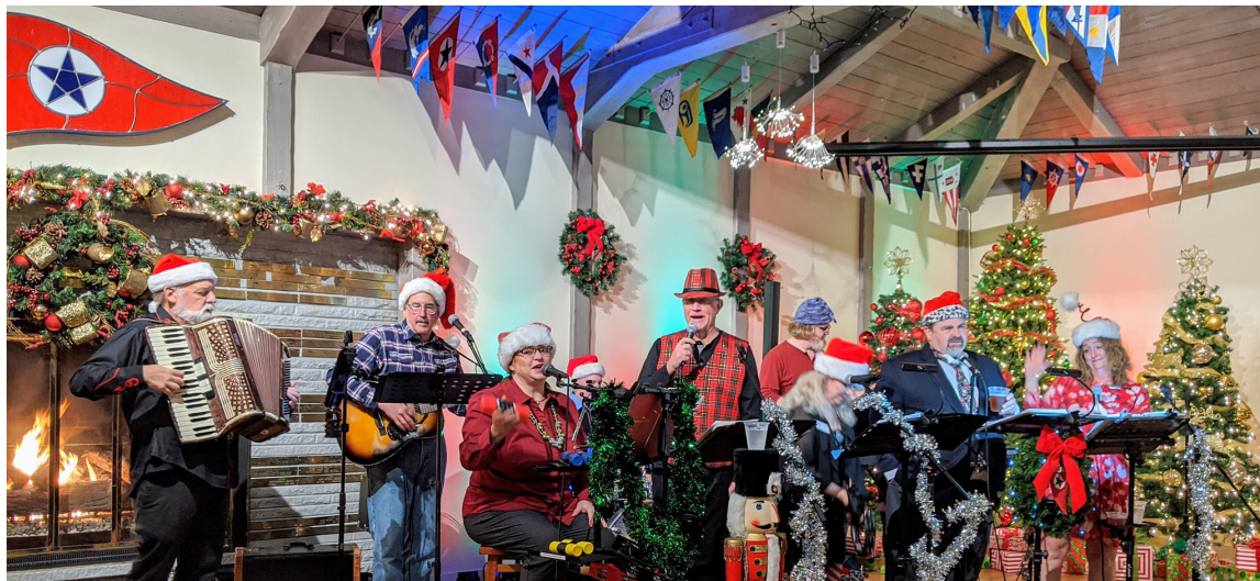
A portion of the QCYC Music Committee at the 2019 Captains' Christmas Dinner

Original members arrived with various experience levels. One or two were then involved in Seattle area bands. A few others had been playing rock, blues, and country music for decades, but would note that it had been at least "a while" since they last suited up to perform.