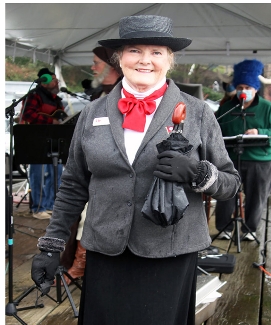
Vice Commodore channels Mary Poppins at Dizzy Disney Dinghy fleet event

involved will be well served to join either of these groups. They have a lot of fun, too. We are looking forward to better cruising weather ahead. Stay well and healthy.