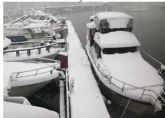
Dock three snow land