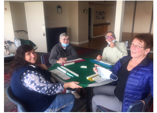
Members return to the clubhouse for fun & games