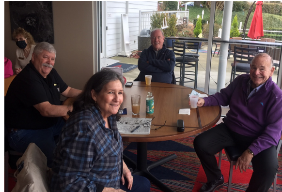
Members enjoy socially distanced catching up