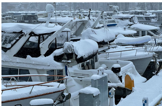
Snow on the rooftops