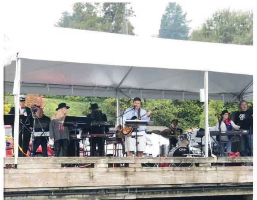
Desolation Sounds performs on Commodore's Dinghy Day