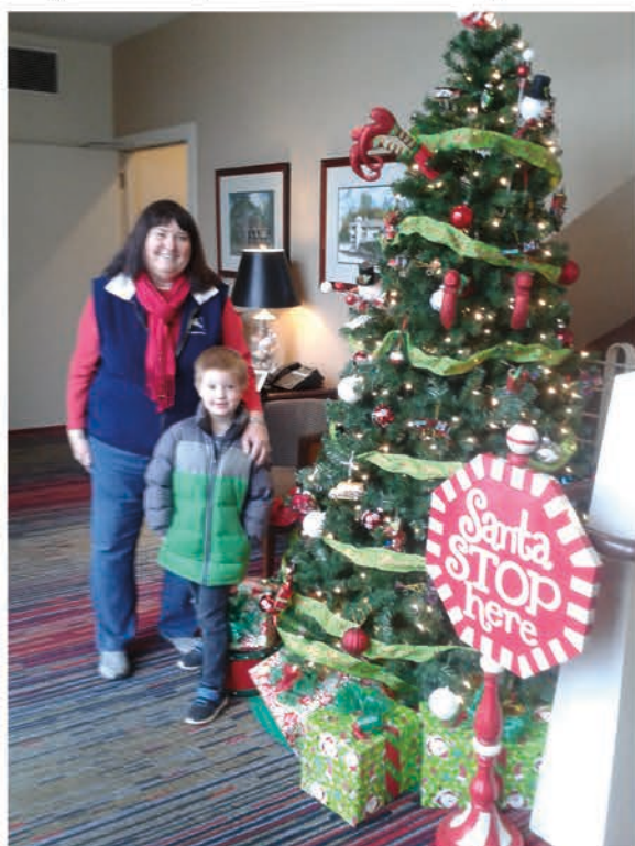
Giving Tree on the second deck welcomes your support

Although COVID has forced the Tarettes to cancel the Captains Dinner, the season of giving won't be held back! The Tarettes have set up a 'Giving Tree' on the second floor to benefit the Boyer Children's Clinic. Members are asked to decorate the tree with envelopes containing a gift card or check payable to Boyer. Since the children at Boyer are not coming in for their sessions, we've been asked to not provide toys this year, but for help for families in need! We are asking members to open their hearts and wallets to buy gift cards or write a check for the amount you would have spent on toys and clothes. Just pin the envelopes provided to the tree on the second deck. Boyer has also asked for warm kids coats for ages 12 months to three years of age. What ever we do will be so appreciated for those families in need. Thanking you all in advance and as Tiny Tim said, " God bless us every one"!