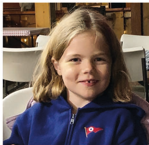
Ship's store stocked with kids stuff for Christmas

will be open for Friday lunches and Saturday breakfasts; but you can always text or call Gail and if she's at the club, happy to open it up! 206-854-5790.