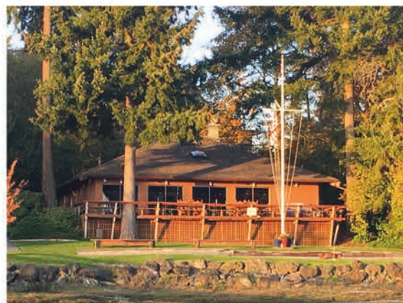
Fall comes to the outstation