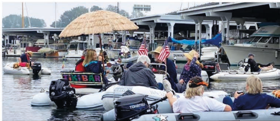
Members attempt somewhat socially distanced Dinghy Cruise-In