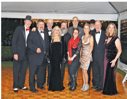
Thanks to house band 'Desolation Sounds' for rocking the ball