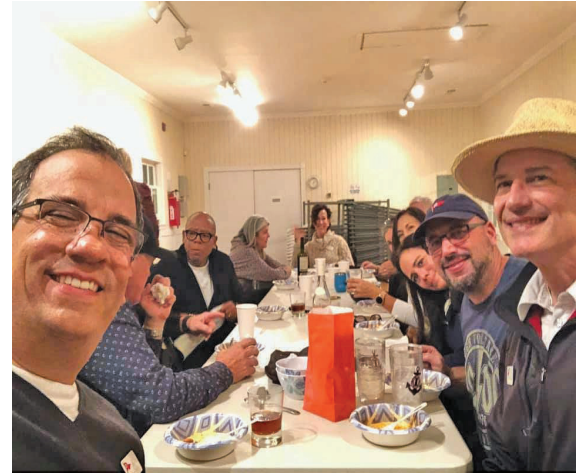
First Fleet Cruise attracts 20 members to Gig Harbor