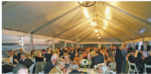
Guests enjoyed presentations & dinner under the big top