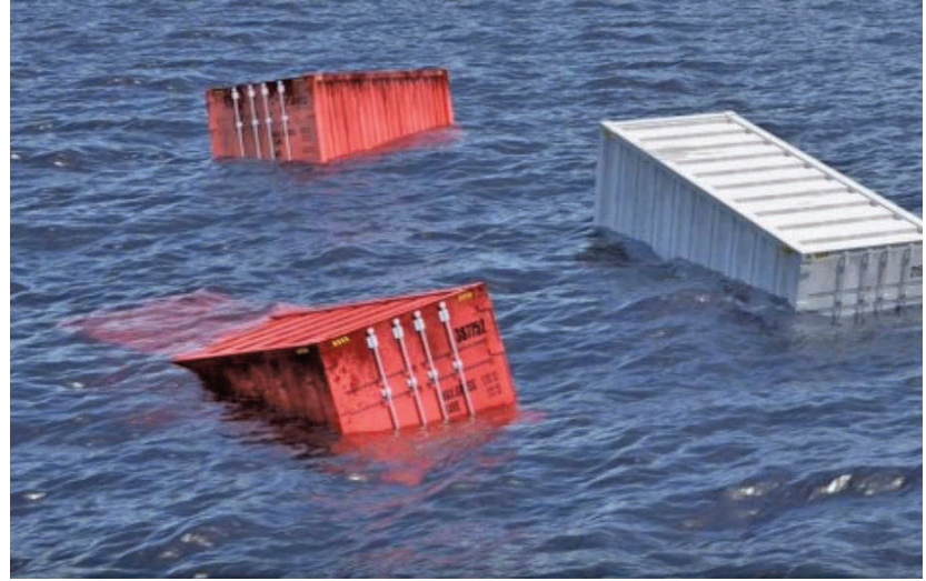
More than 40 containers adrift off Vancouver Island following storm