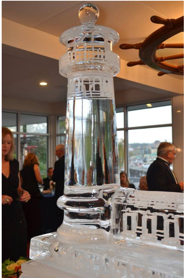
An over-the-top ice sculpture is a hit among the crowd.