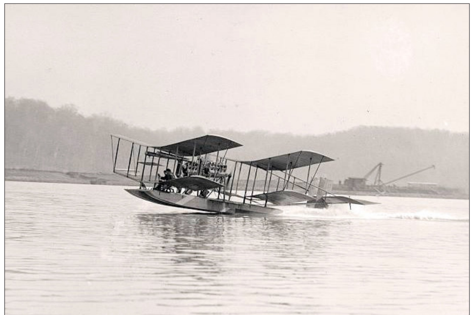
The seaplane almost sank at the 1926 QCYC races.