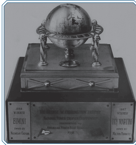
Codrington Trophy for Best Overall