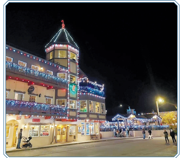
Fleet Captains' Land Cruise Lit up Leavenworth