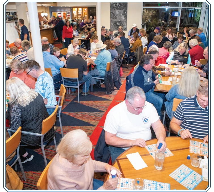
Full House on the Second Deck for Bingo, Pizza & Fun