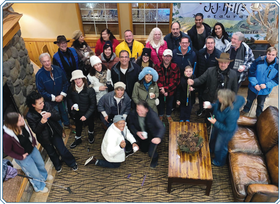
2023 QCYC Fleet Land Cruisers