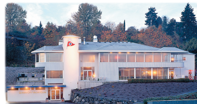
on Portage Bay in Seattle