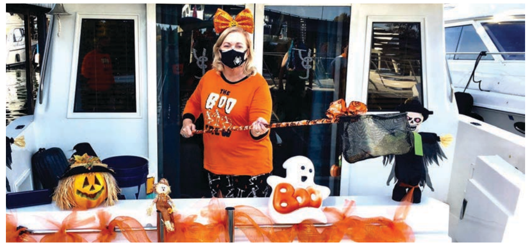
The 'Boo Crew' serves up treats at Fleet Captain's Halloween dock walk