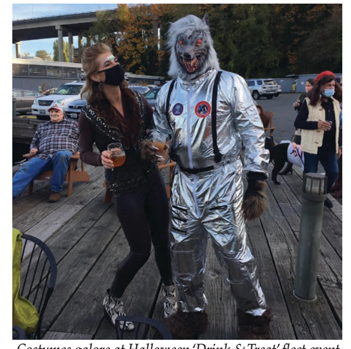
Costumes galore at Halloween 'Drink & Treat' fleet event at the mainstation