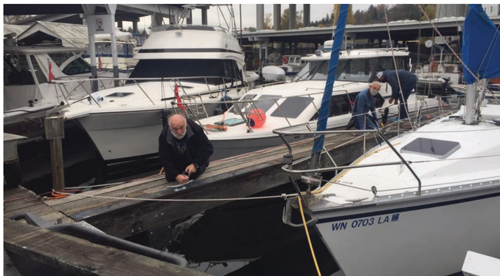
Join the crew for breakfast & 'Docks Fun Day' the second Saturday every month