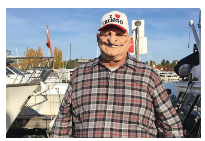
Halloween on the docks brought out the best of us