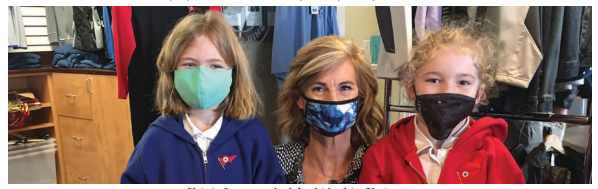
Ship's Store stocked for kids this Christmas