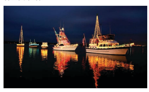
Decorated boats welcome for unofficial cruise

nothing that says members can't decorate their boats and go for a cruise. And if there happen to be other decorated boats immediately ahead and immediately behind.... since there's no "official" parade, that will have to be considered a coincidence.