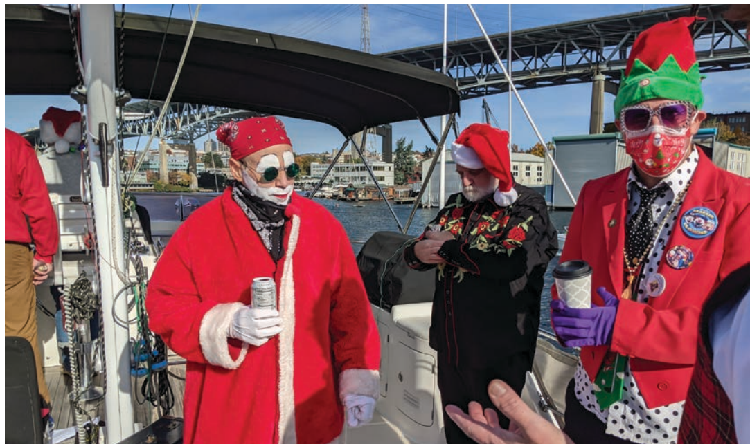
Of course beverages were involved