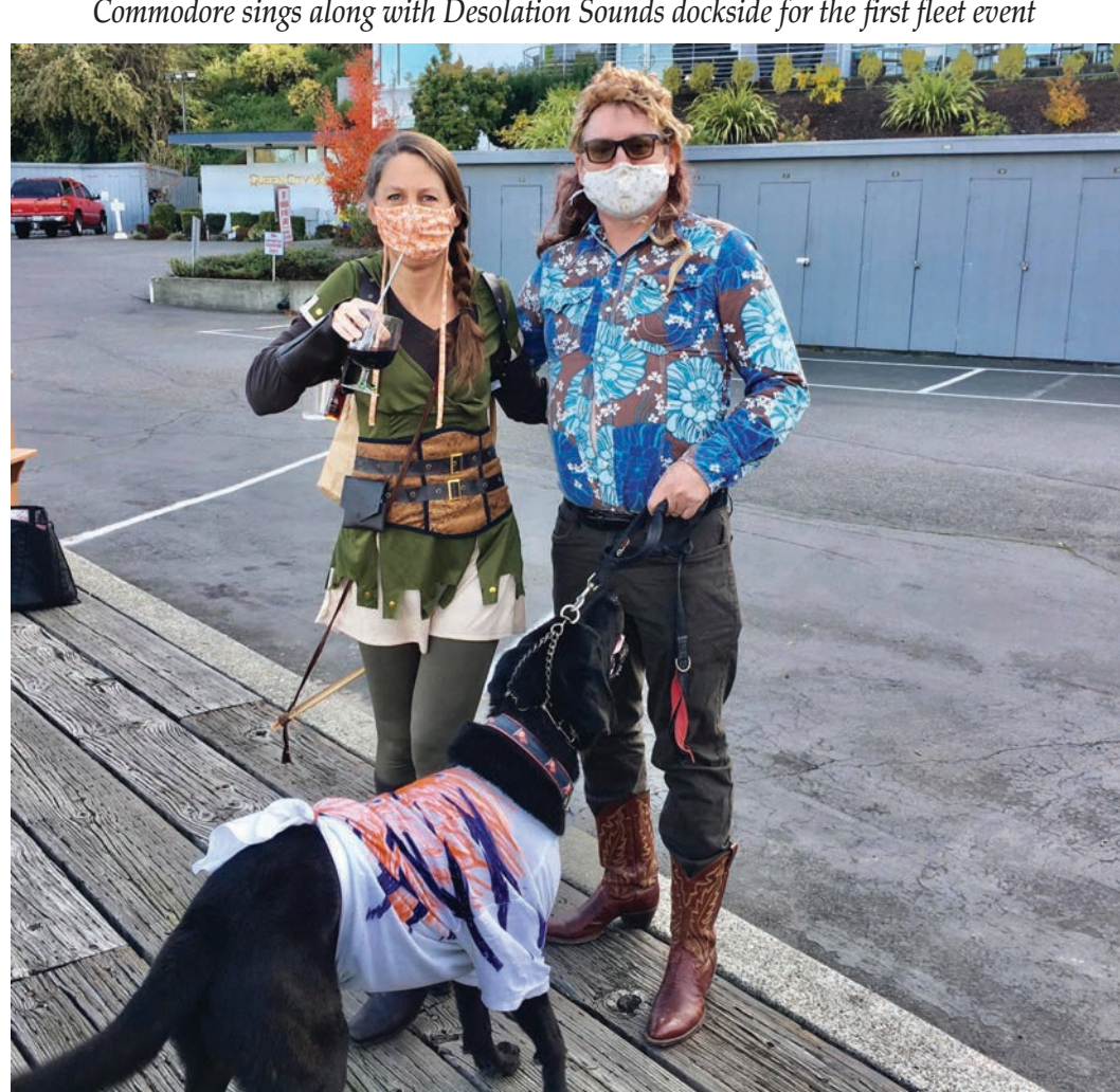
Masked up & dressed up for the first fleet event