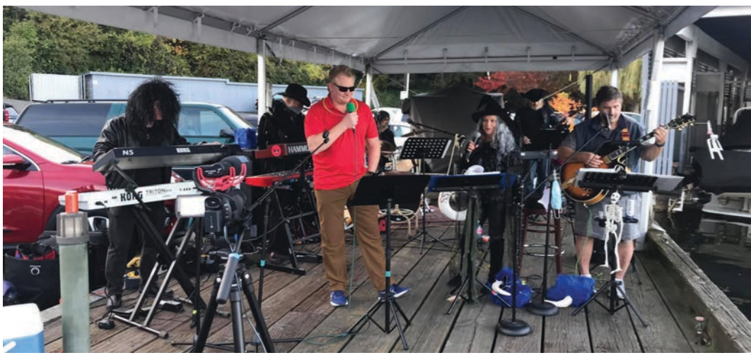
Commodore sings along with Desolation Sounds dockside for the first fleet event