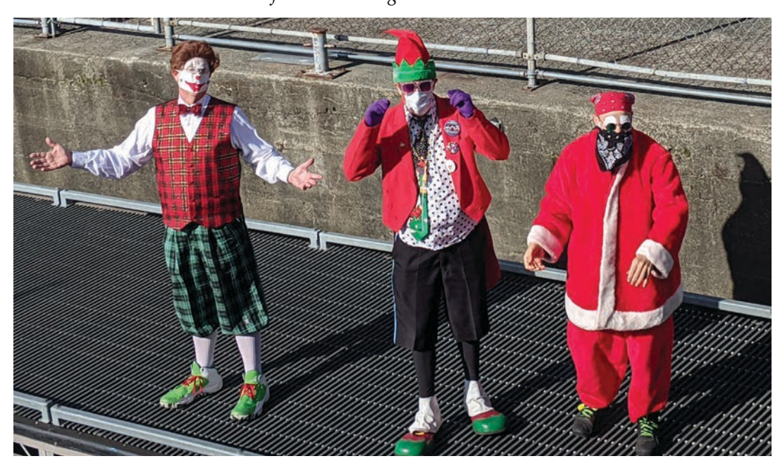
Shoreside entertainers mug for the camera