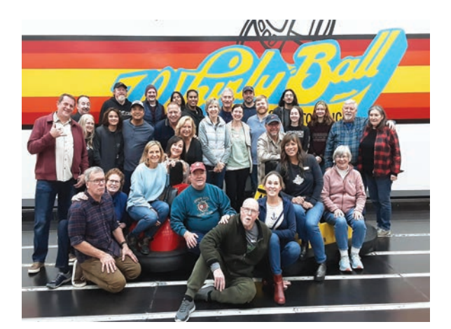
Fleet Captains Whirlyball land cruisers

Wishing all Members and their families a safe and joyous holiday season!