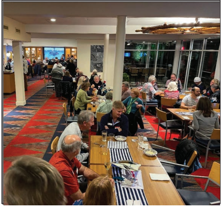
More than 80 Members Attended the Sailor Social Stew & Brew