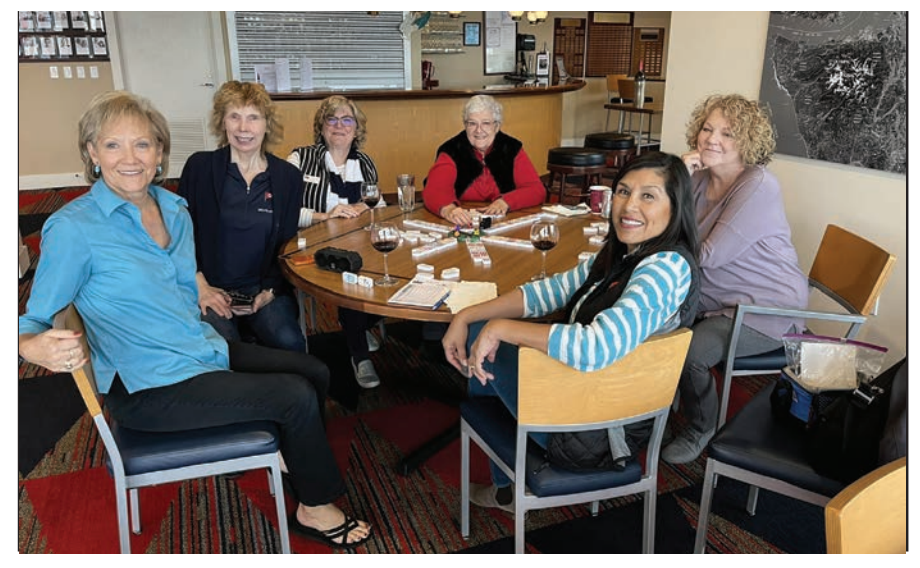
After Friday Lunch Tarettes 'Mexican Dominoes' - Join Up!!