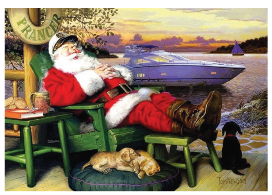
Santa at rest