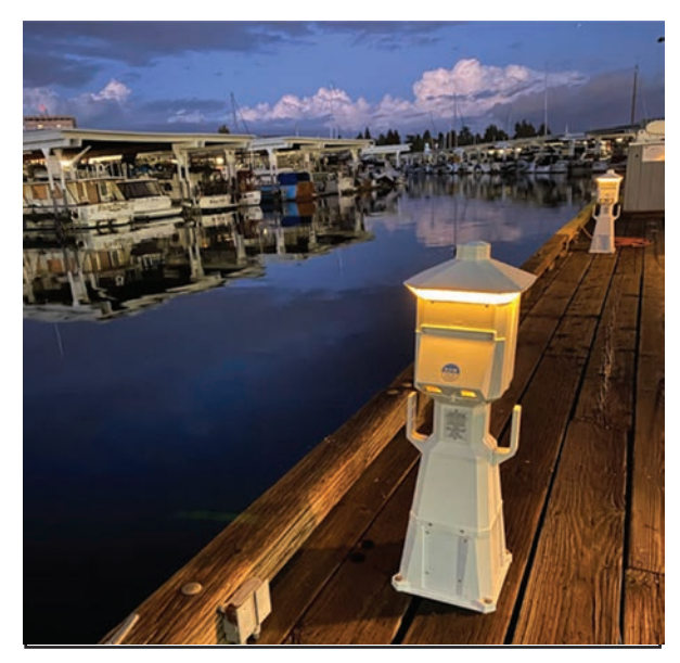
New shore power pedestals at the Mainstation

Besides Ground Fault electrical safety, two bonus objectives were also accomplished. We were able to move the pedestals one foot further away from the edge of the dock to reduce the risk of vessels hitting them when docking. And the new sensor-controlled LED lights on the pedestals not only look great they provide light inside the pedestal so you can see the outlets to insert your plug and they illuminate the dock