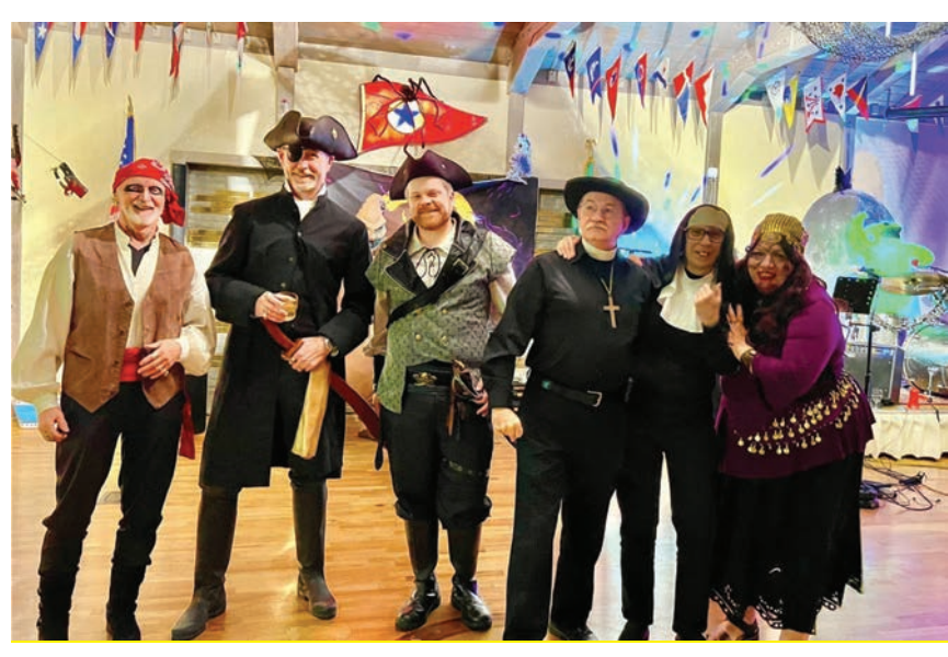
Halloween Party was fun for everyone