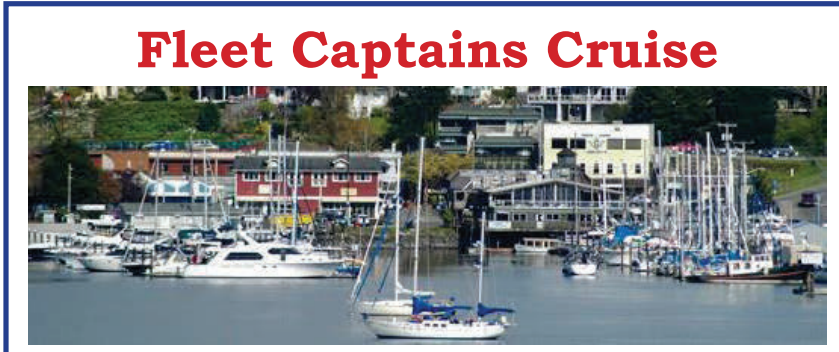
Commodore, Captains & Guests...