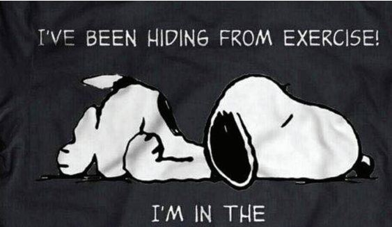
I'M IN THE FITNESS PROTECTION PROGRAM

Andy Gerde -Your knowledgeable and reliable yacht broker.