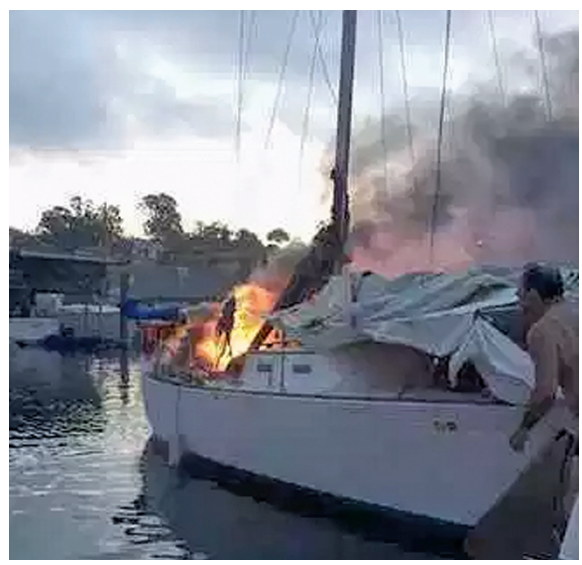
Prevent boat fires – check your electric heater

3.) It is best NOT to use an extension cord with a PEH. If you must, do not use cheap, thin extension cords to power your PEH. Due to the amperage of your PEH, cheap extension cords are more prone to getting hot and causing a fire. Spend the extra few bucks to get a heavy duty extension cord. It should be at least 14 gauge wire, but a "smart cord" may allow for 16 gauge wire. Check out: Fire Shield 16/3 Extension Power Cord w/ Advanced Safety LCDI, 8-Foot, White