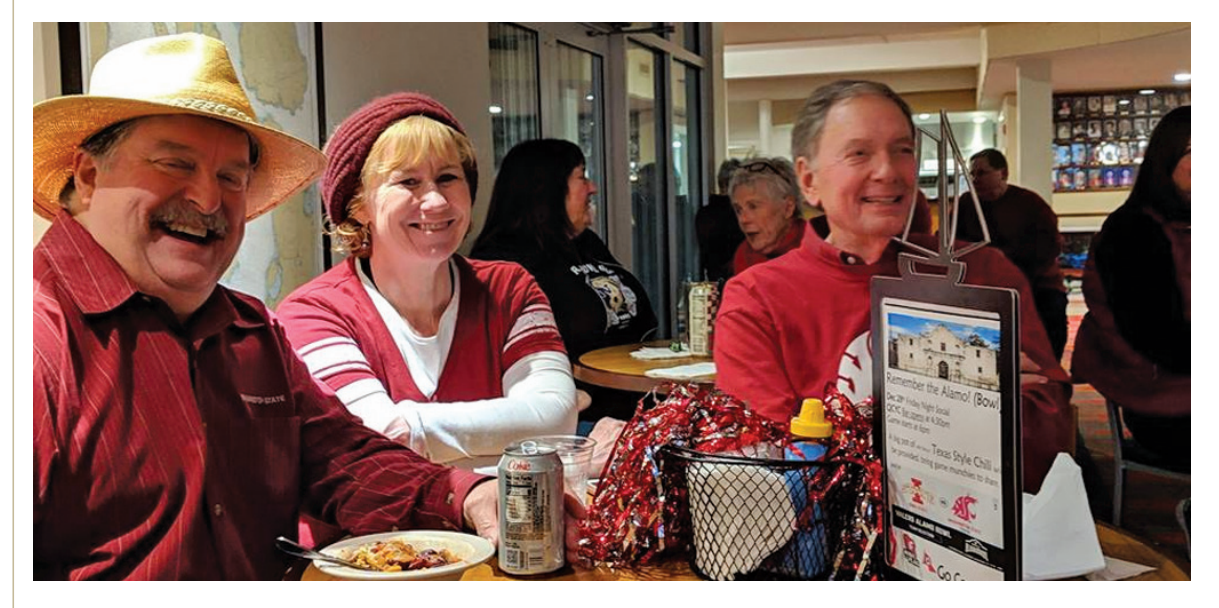
Good old Friday night social at the yacht club with friends