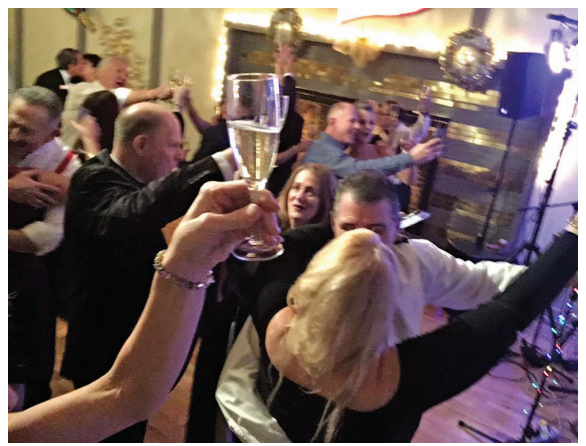
SS2019 rocks as the clock strikes midnight in New York and Seattle