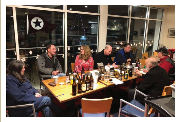
QCYC Beer Committee "hops" to select best bar beers