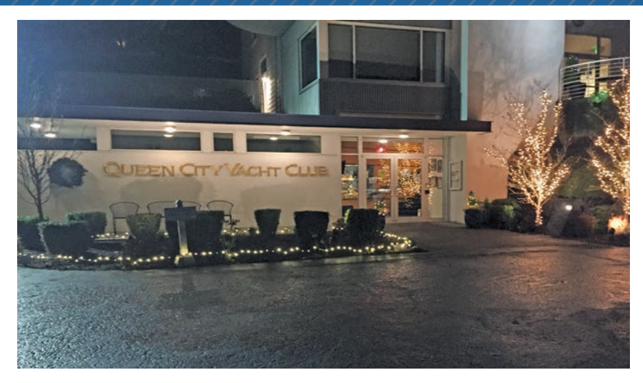
Christmas at the mainstation thanks to member volunteers