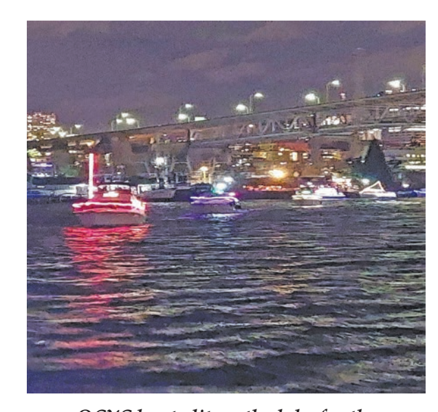
QCYC boats lit up the lake for the Chet Gibson 'linear' cruise