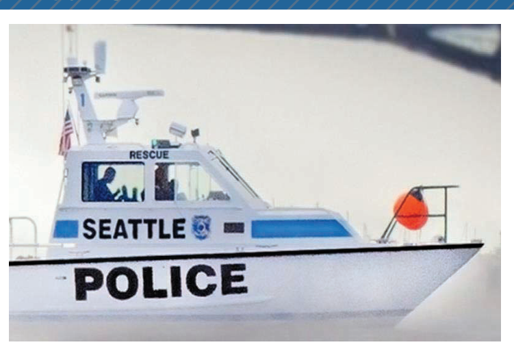
Boaters' actions helped save Harbor Patrol from drastic budget cuts