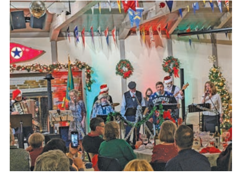
Desolation Sounds entertained the night away at the Captains Christmas Dinner

A Big Shout out to the Tarettes for the Captains Dinner and all the generous gift cards worth more than $3200 for the Boyer Children's Clinic. Thank you all!