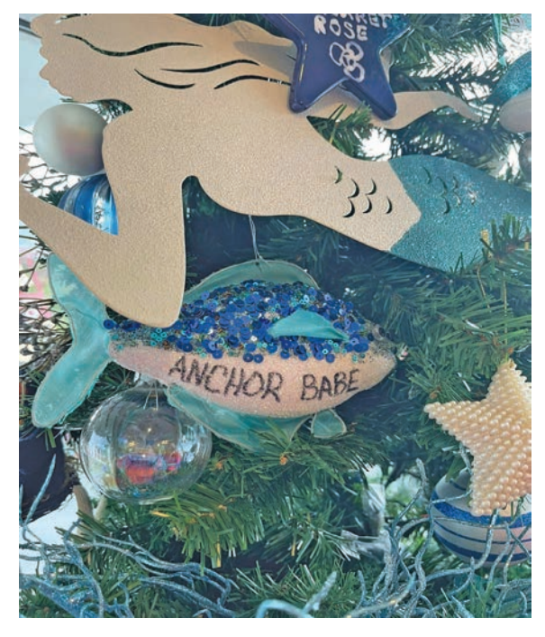
Anchor Babe - Lindholme