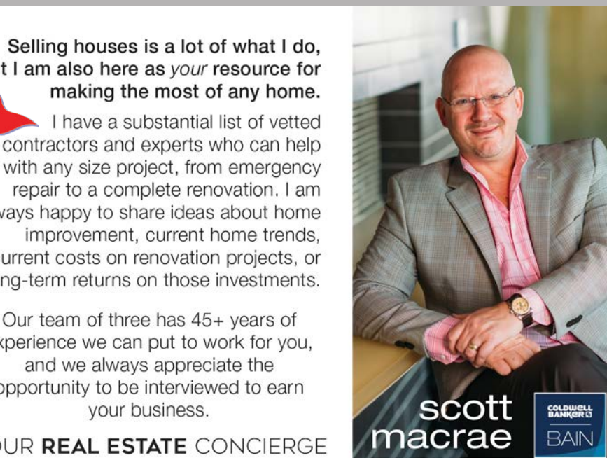
Selling houses is a lot of what I do, but I am also here as your resource for

contractors and experts who can help with any size project, from emergency repair to a complete renovation. I am always happy to share ideas about home improvement, current home trends, current costs on renovation projects, or long-term returns on those investments.