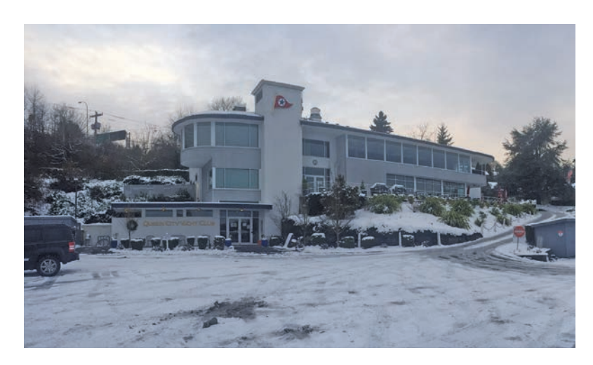
Snow show at the mainstation during holiday break

The durn Queen City spiders Spin webs around the lights They know there will be insects To dine upon each night Out came some members And swept their webs away So we can all be spider free At least for one more day