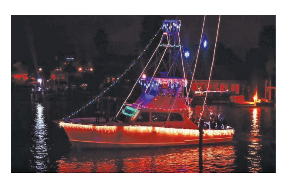
Stocklins' 'Alfie' all decked out as the Chet Gibson 'turn boat' on Lake Union