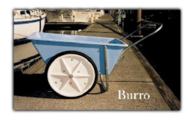
The dock carts have taken, not well, to swimming and wandering. Changes are afoot to keep them readily available.