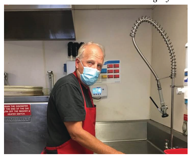
Several volunteers worked the dishwasher all weekend