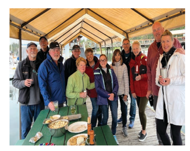
QCYC crew enjoy happy hour at the Deer Harbor oustation

By the time you read this, Memorial Day weekend will have happened. Then July 4th weekend and Labor Day will be the next big weekends. These events are always well attended and worth participating in if you haven't before. Safe boating!