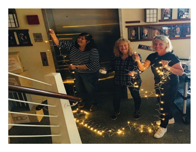
Members light up the mainstation for Opening Day