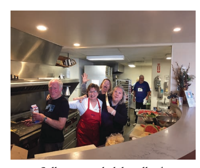
Galley crew rocked the galley for Tarettes Sunday morning breakfast

I bid you all farewell and wish you a wonderful summer of boating!