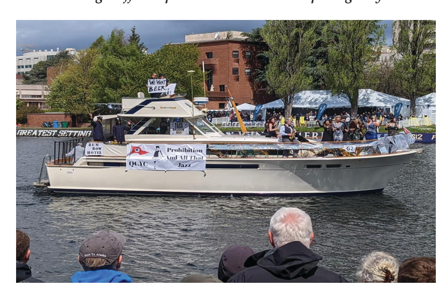
QCYC Opening Day decorated boat present the Rum Row Motel & all that jazz aboard Blue Crab