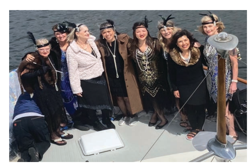
Thanks to ragtime dance troupe for helping QCYC win in our decorated boat category