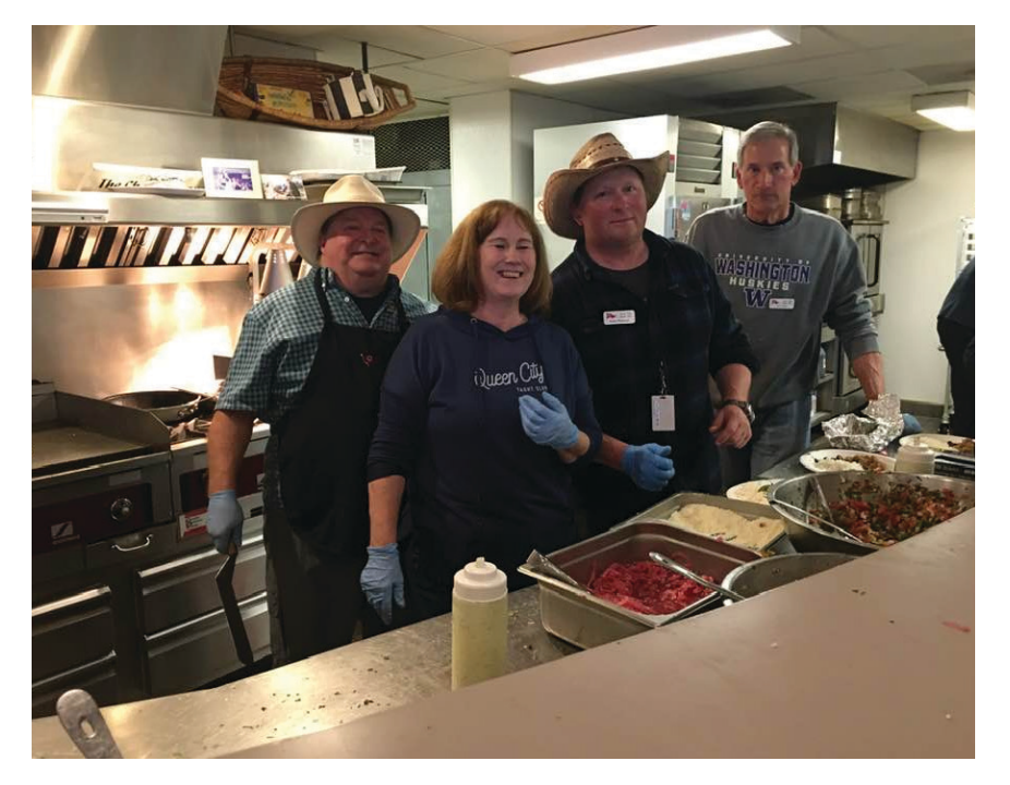
Street Taco Thursday crew in the galley