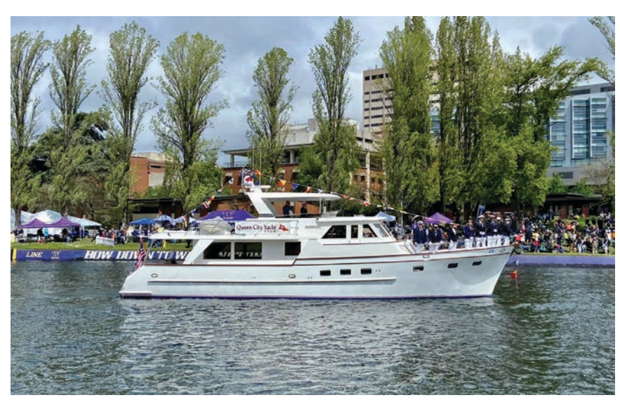
Bridge Officers present our colors on Opening Day