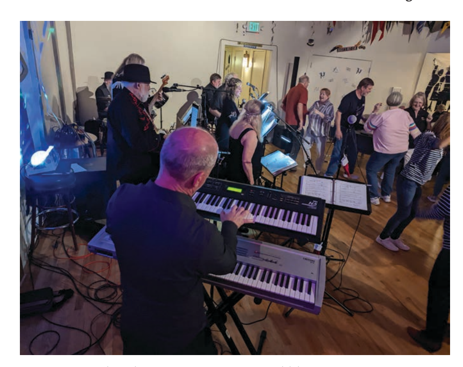
House bands got great reviews and blew visitors away