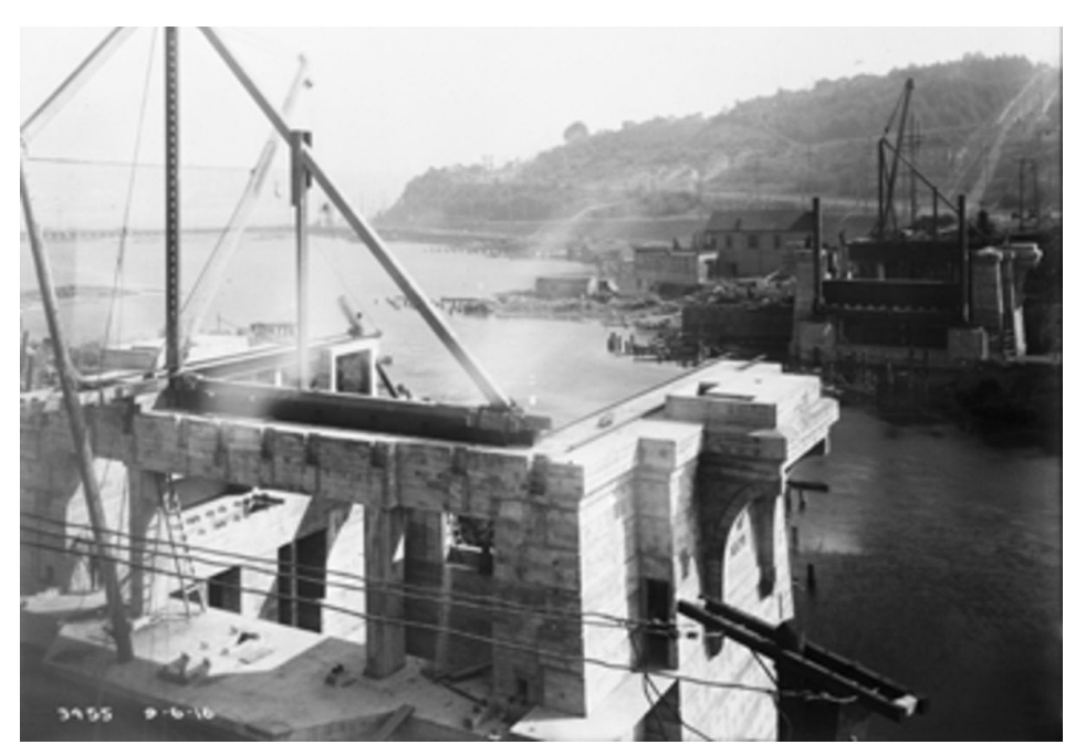
1916 Fremont Bridge takes shape while QCYC gets organized