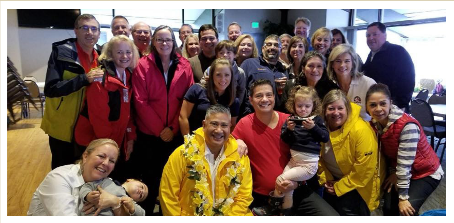
QCYC group strikes a daffodil pose.