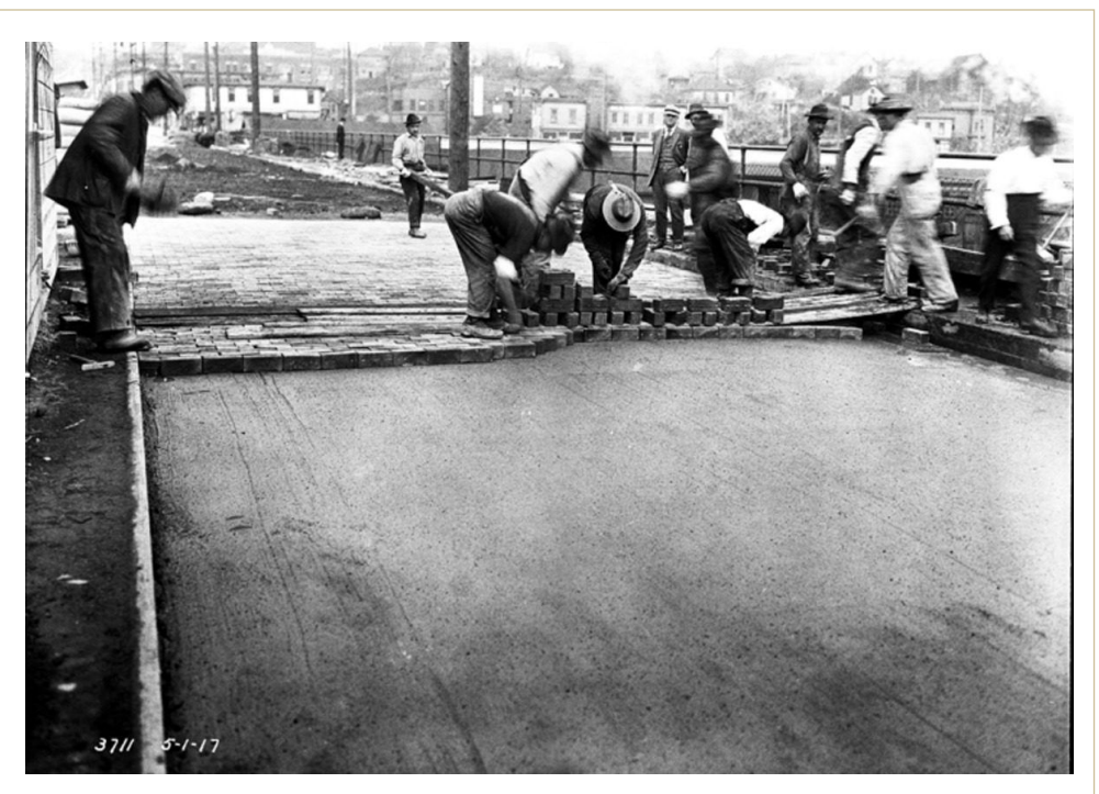
1917 Bricks & Paving new Fremont Bridge