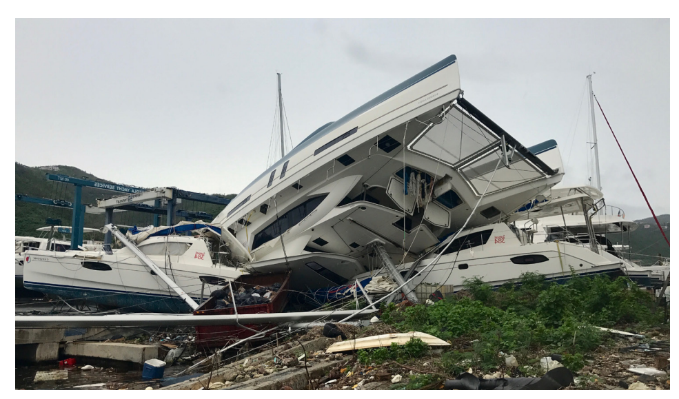
Hurricane damaged boats litter the Puerto Rico shoreline.