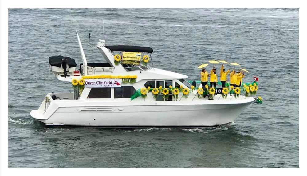
QCYC daffodil revelers in costume'