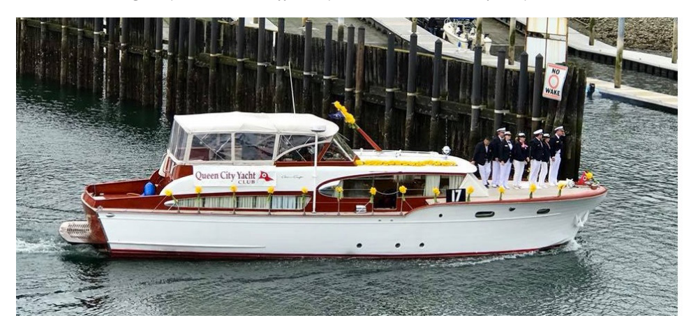
'QCYC officers on deck at daffodil festival'