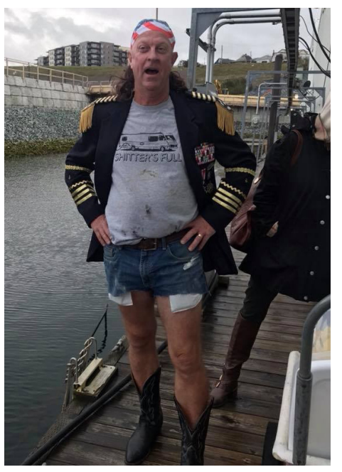
Commodore wins TYC Daffodil best redneck costume.