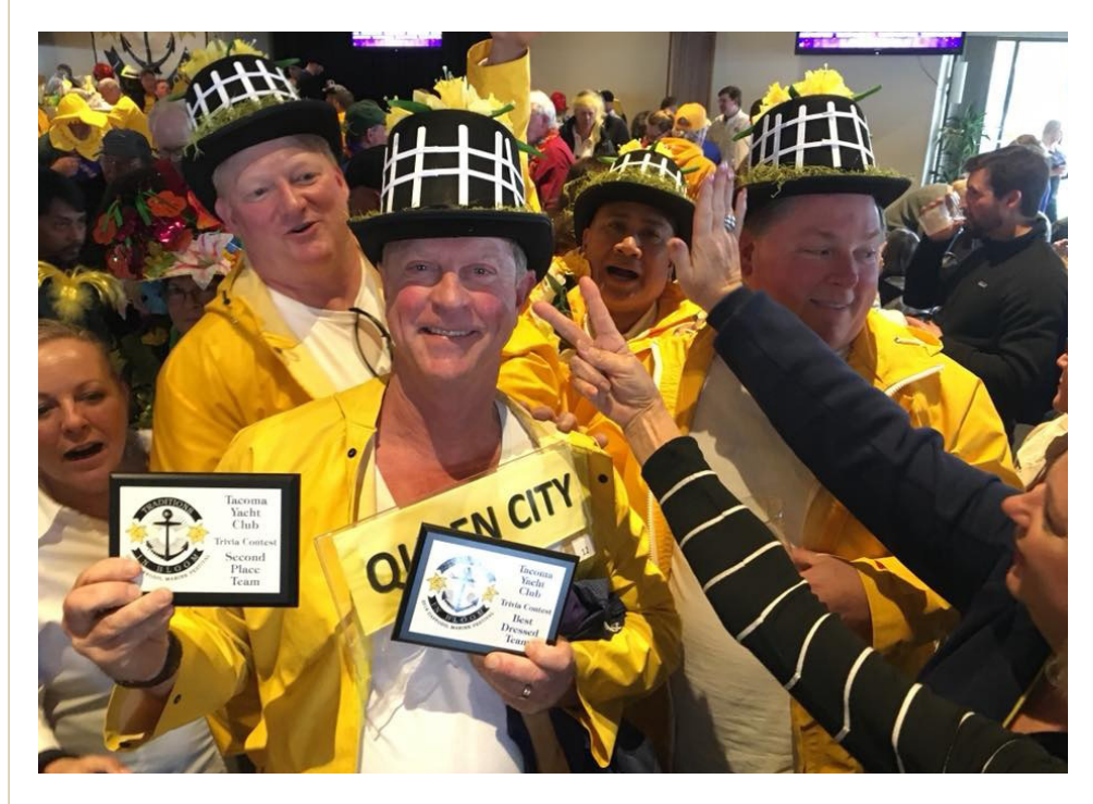
Commodore & crew win at Daffoil Festival cruise-in.