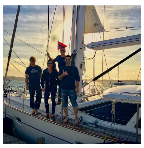
Crew sets sail for hurricane relief.