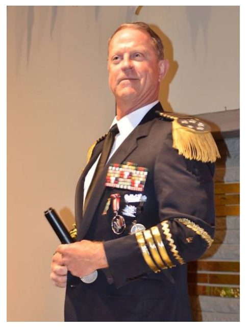
Commodore models new uniform.