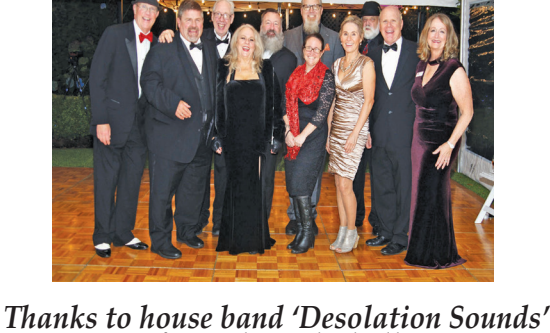
for rocking the ball