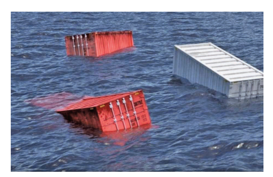
More than 40 containers adrift off Vancouver Island following storm

The Outstation continues to improve thanks to Members Rico Adams and Dan Heffernan. They surprised me with this beautiful border around the dwarf Japanese maple that was planted last spring!