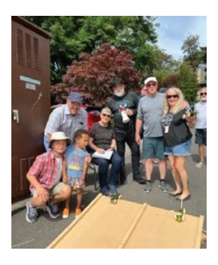
Crew for Labor Day cucumber race