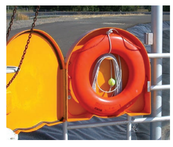
Mainstation docks get new Life Rings

Moorage members on Dock 1 know how to rock it!