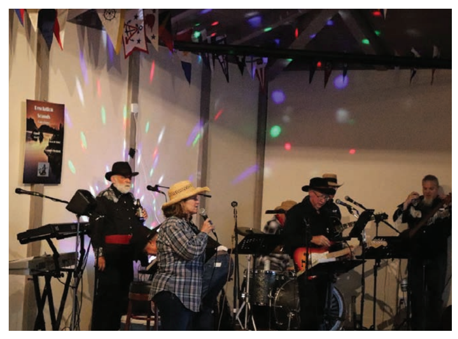
3-Sheets house band rocks country tunes at the Steak Fry