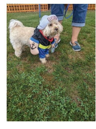
Ready for the Labor Day Pet Parade at the outstation