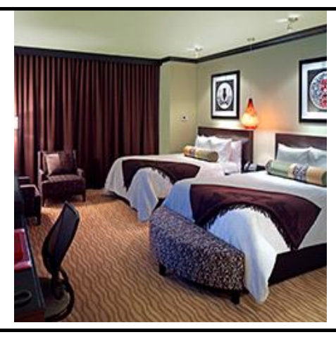
Deluxe Room with two Queen Beds 206.04 (Tax is included) Split the cost and Share a room!