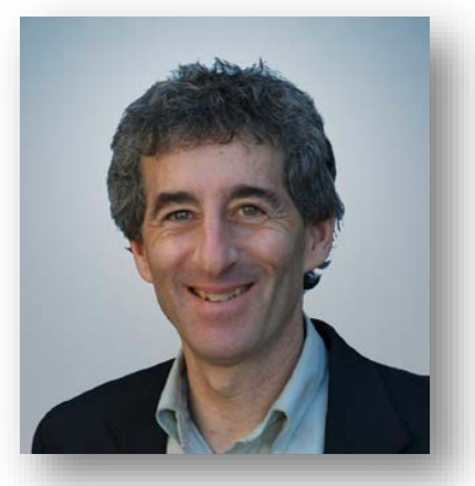
To learn more about Cliff's work, explore his blog at: http://cliffmass.blogspot.com/