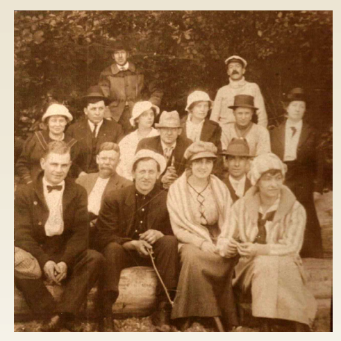
Participants in the 2nd offical Queen City Cruise, to Pt Bolin.

The newspaper mentioned a possible visit to the