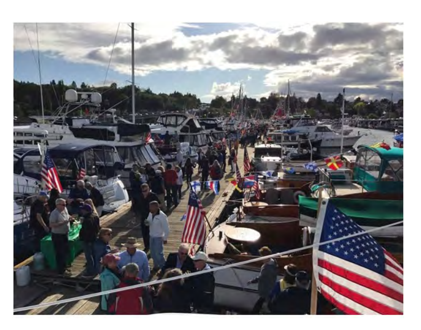
Opening Day boaters and looky-lous mingle on Dock 0 at Seattle Yacht Club.

just playing around all those months between Halloween and Opening Day, she also managed to be behind the scenes in shaping every part of the huge effort that culminated in a party every day, Wednesday through Sunday, of Opening Day week.