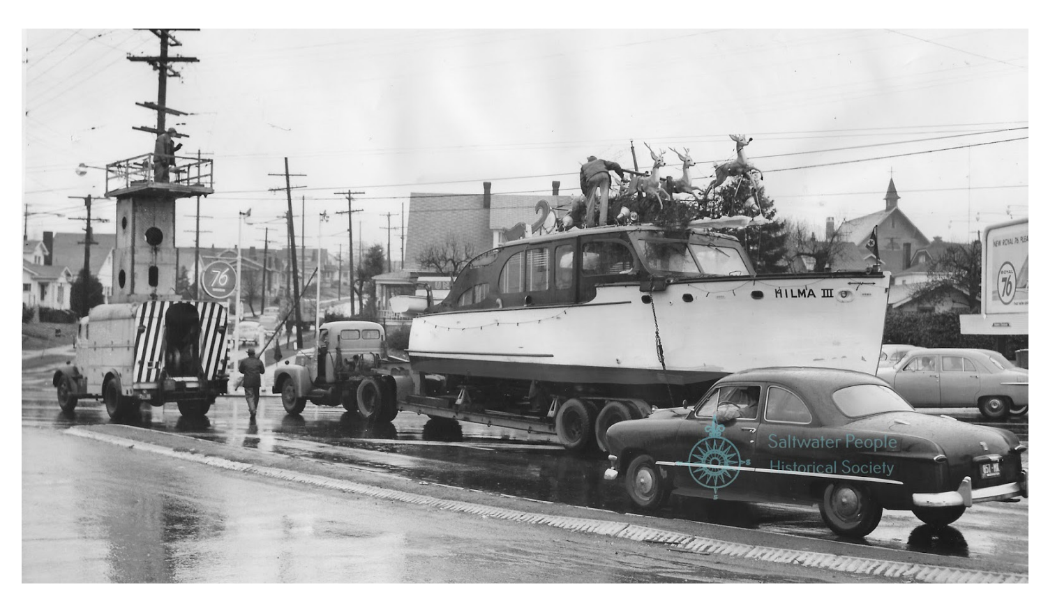
QCYC boats were trailered to Green Lake during war years when Lake Union was blacked out.