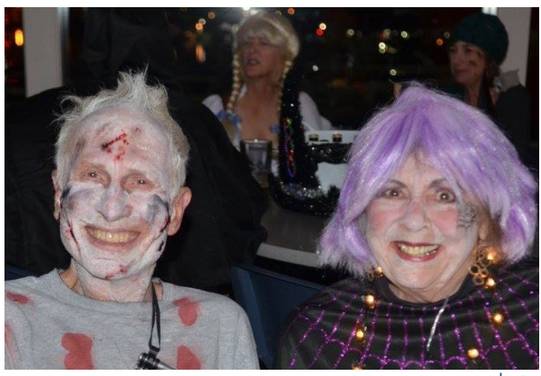
THE BILGE PUMP | 15