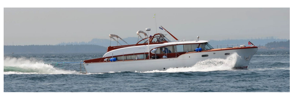
The Grimm's Kay Gee Lady underway.