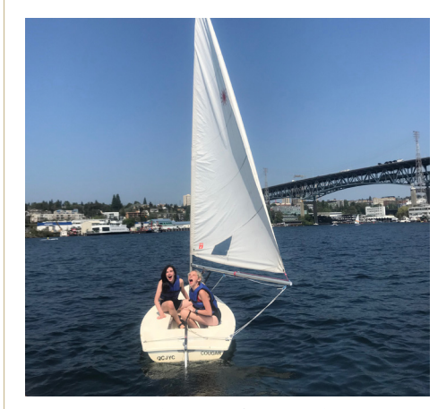
Juniors having fun on the water.