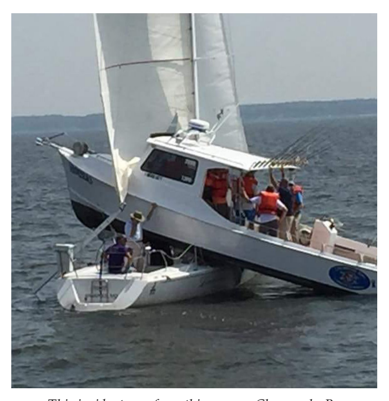
This incident was from this year on Chesapeake Bay.

<u>Sunday Night</u>: Hors D' Oeuvres Hosted by Dock B Handmade Pizza catered by Bene Pizza. Drain the Keg.