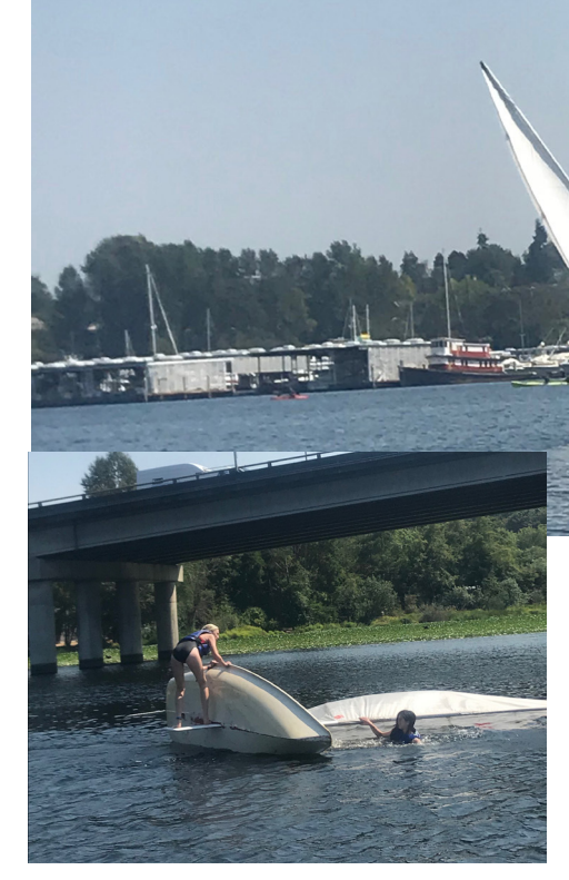
following members continue to give their time unselfishly whenever and with whatever needs attention to keep our junior campers safe with a properly running

In the tradition of QCYC, our junior boating program only continues to thrive due to the incredible volunteer work from our members. This year, the