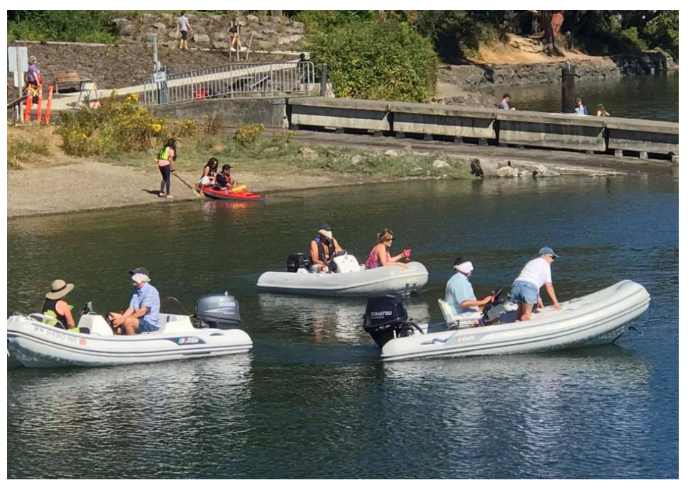
Laid back Labor Day blind man's dinghy cruise at the outsstation.