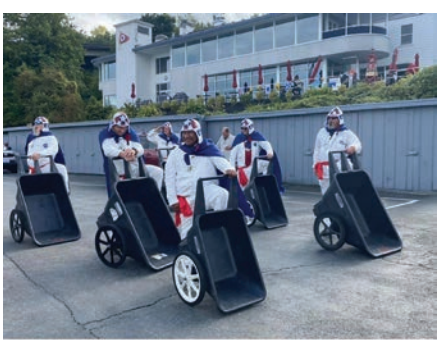
Return of the QCYC 'Dock Cart Drill Team'